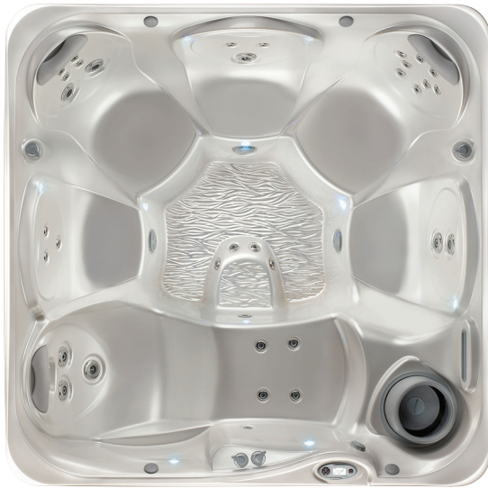
Relay shown with Pearl shell