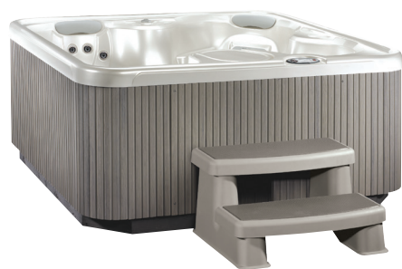
SX shown with Pearl shell/ Coastal Gray cabinet and Polymer step