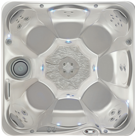
Rhythm shown with Pearl shell