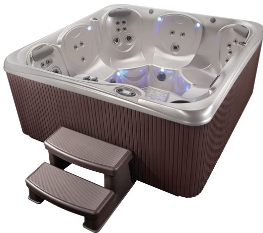
Relay shown with Pearl shell/ Espresso cabinet and Polymer step