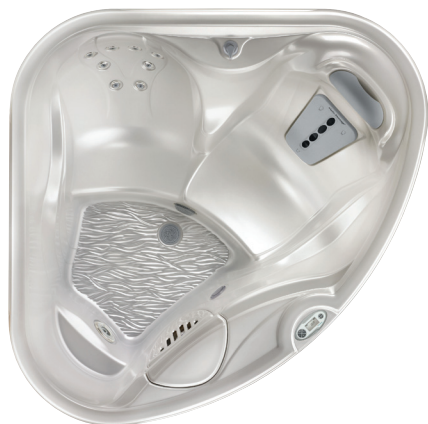
TX shown with Pearl shell