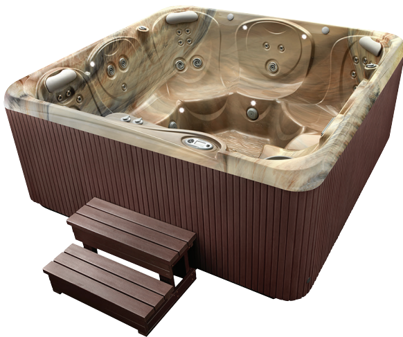
Tempo shown with Tuscan Sun shell/ Espresso cabinet and Everwood® step