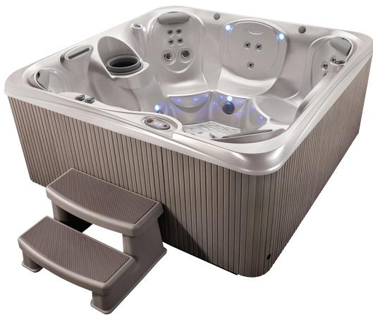
Rhythm shown with Pearl shell/ Coastal Gray cabinet and Polymer step