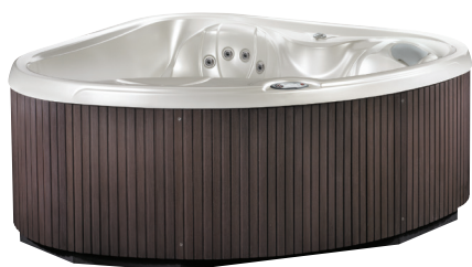
TX shown with Pearl shell/ Espresso cabinet