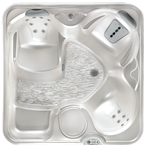
SX shown with Pearl shell