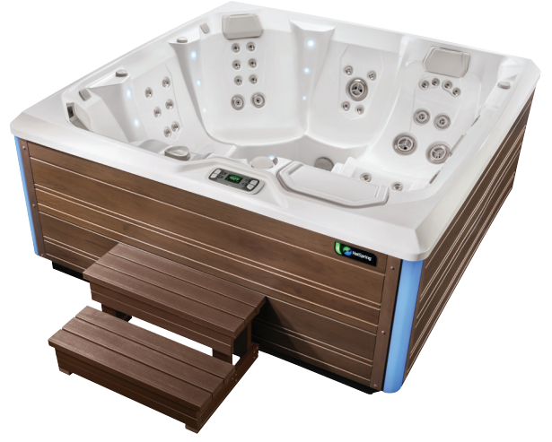
Flair shown with Alpine White shell & Espresso cabinet