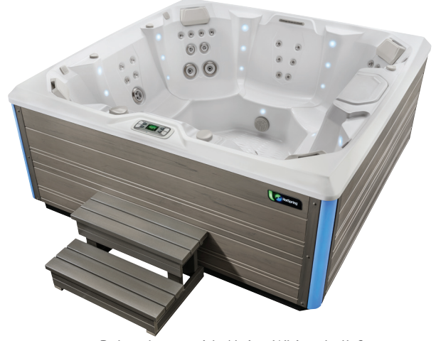
Pulse shown with Alpine White shell & Coastal Gray cabinet