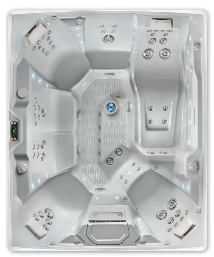
Prism shown with Ice Gray shell