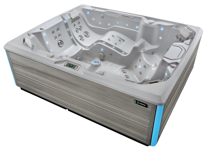
Prism shown with Ice Gray shell & Coastal Gray cabinet