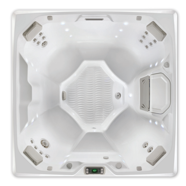
Beam shown with Alpine White shell