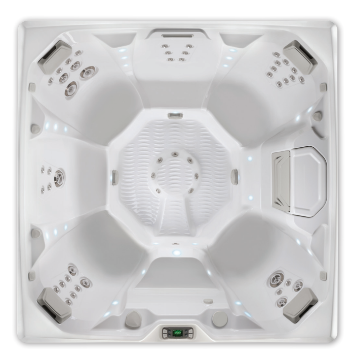
Pulse shown with Alpine White shell