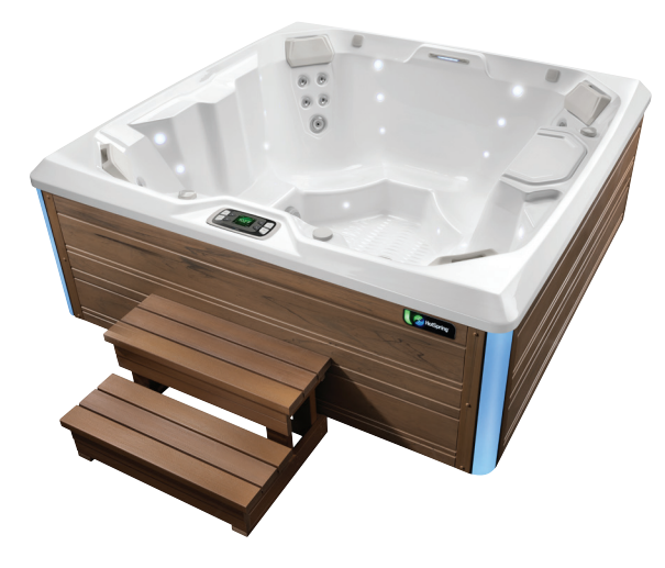
Beam shown with Alpine White shell &