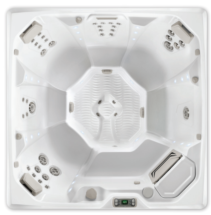
Flash shown with Alpine White shell