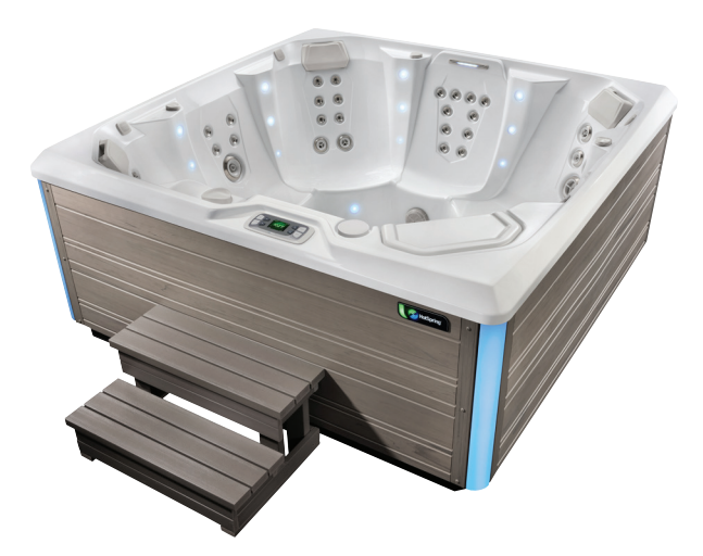
Flash shown with Alpine White shell & Coastal Gray cabinet