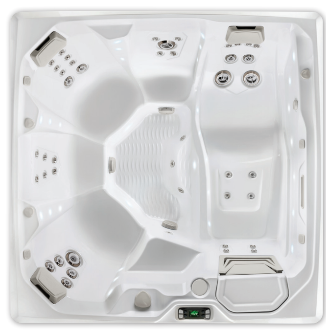
Flair shown with Alpine White shell