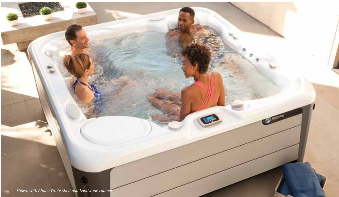
Shown with Alpine White shell and Sandstone cabinet