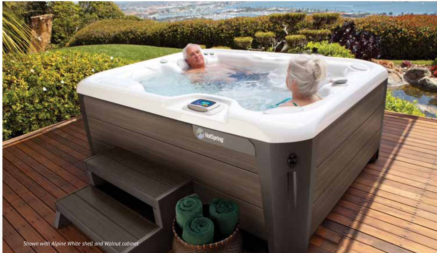
Shown with Alpine White shell and Walnut cabinet