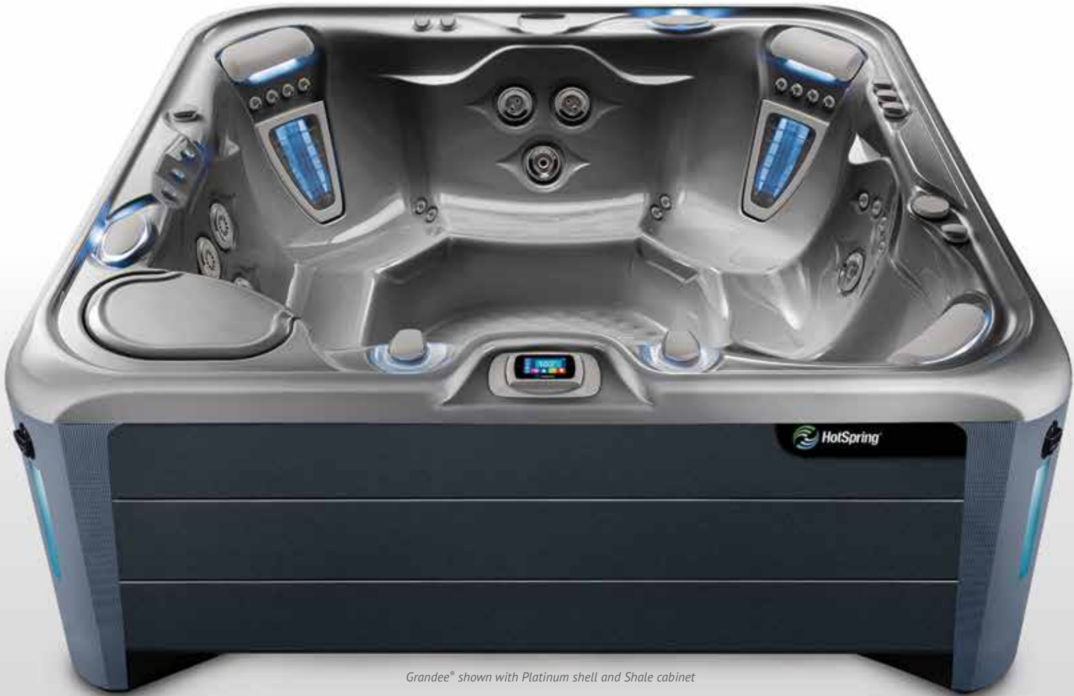
Grandee® shown with Platinum shell and Shale cabinet

Six cabinet finishes include textures and tones influenced by wood, metal and stone. Combine those with a variety of designer-selected shell color combinations and you can create a look that’s just right for you, from traditional to cutting-edge contemporary.