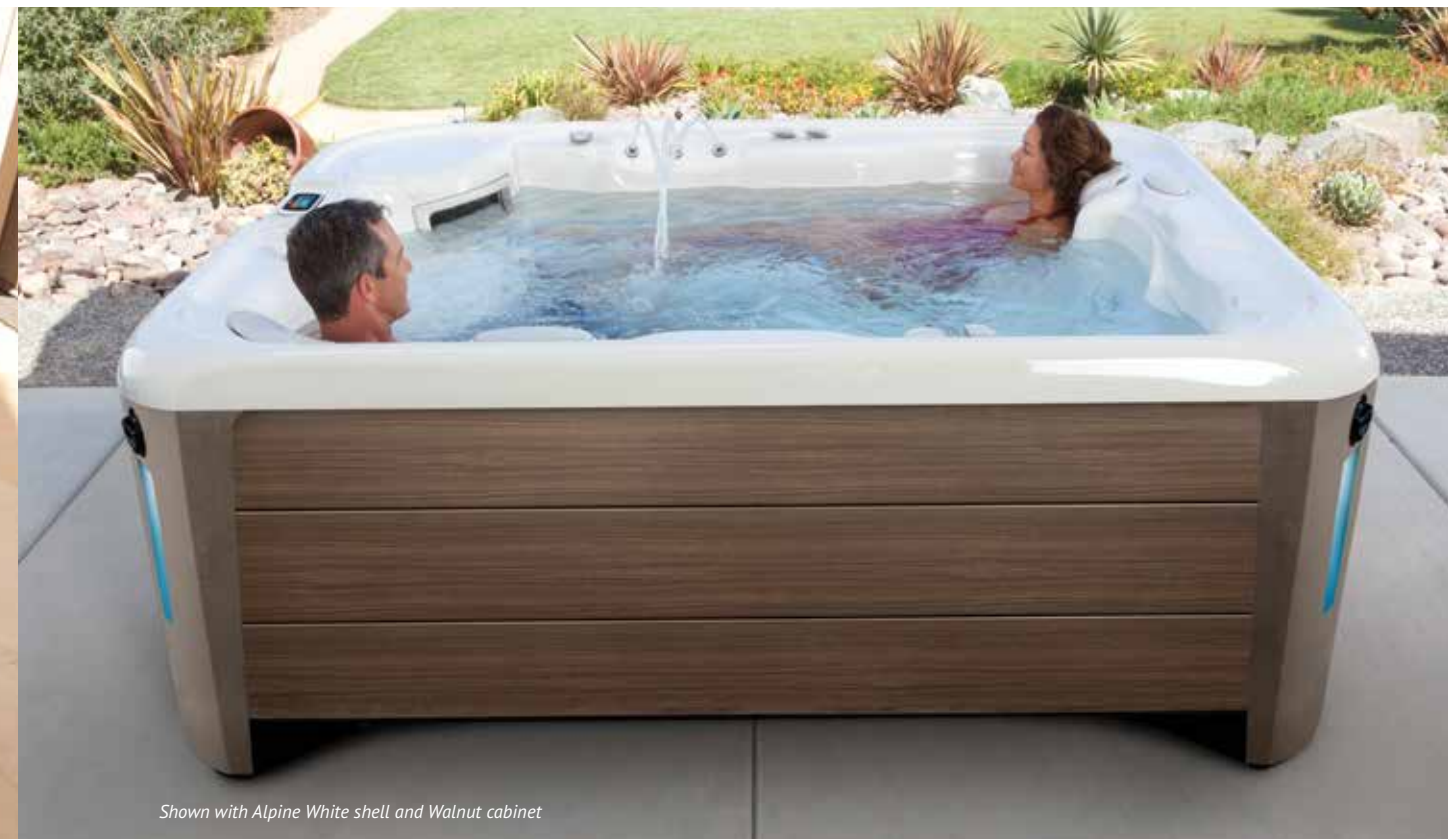
Shown with Alpine White shell and Walnut cabinet