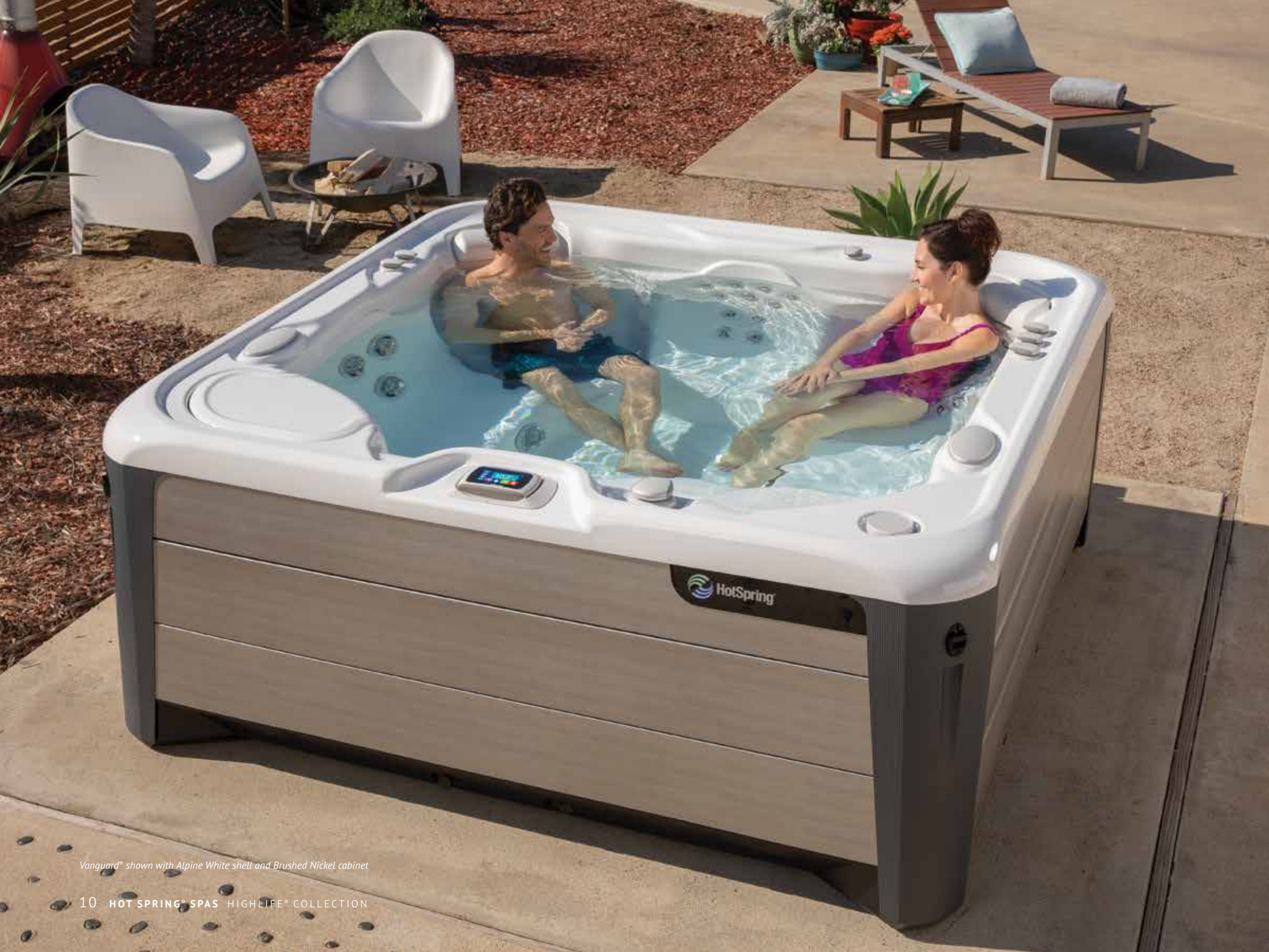
Vanguard® shown with Alpine White shell and Brushed Nickel cabinet