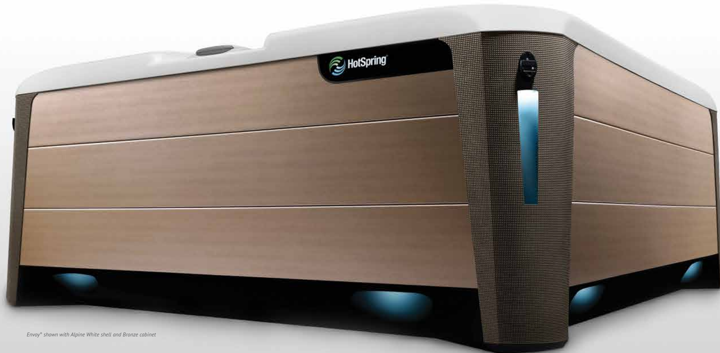
Envoy® shown with Alpine White shell and Bronze cabinet

Built for Years of Use Polymer support structure and base pan for durability and long life