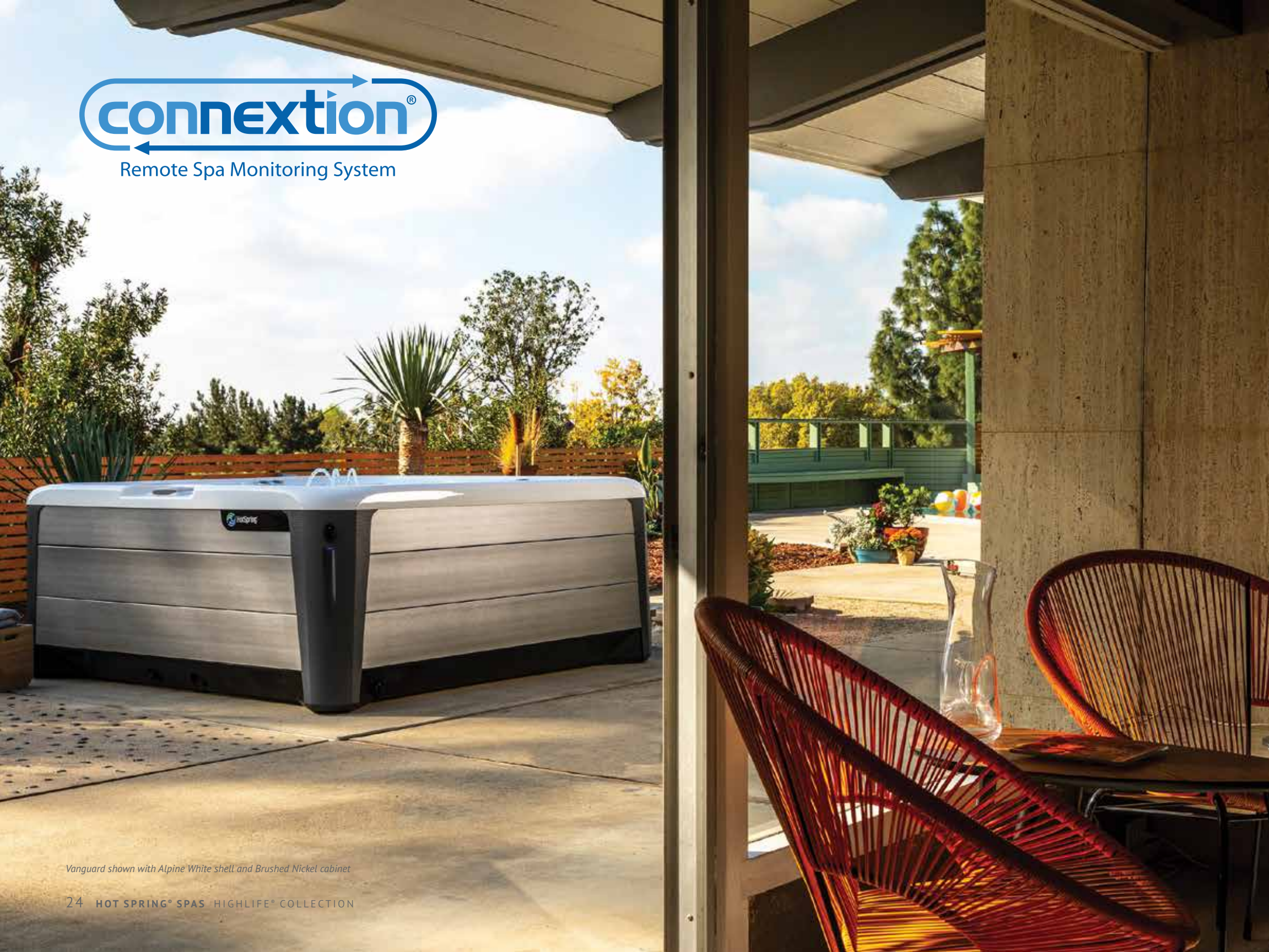
Vanguard shown with Alpine White shell and Brushed Nickel cabinet