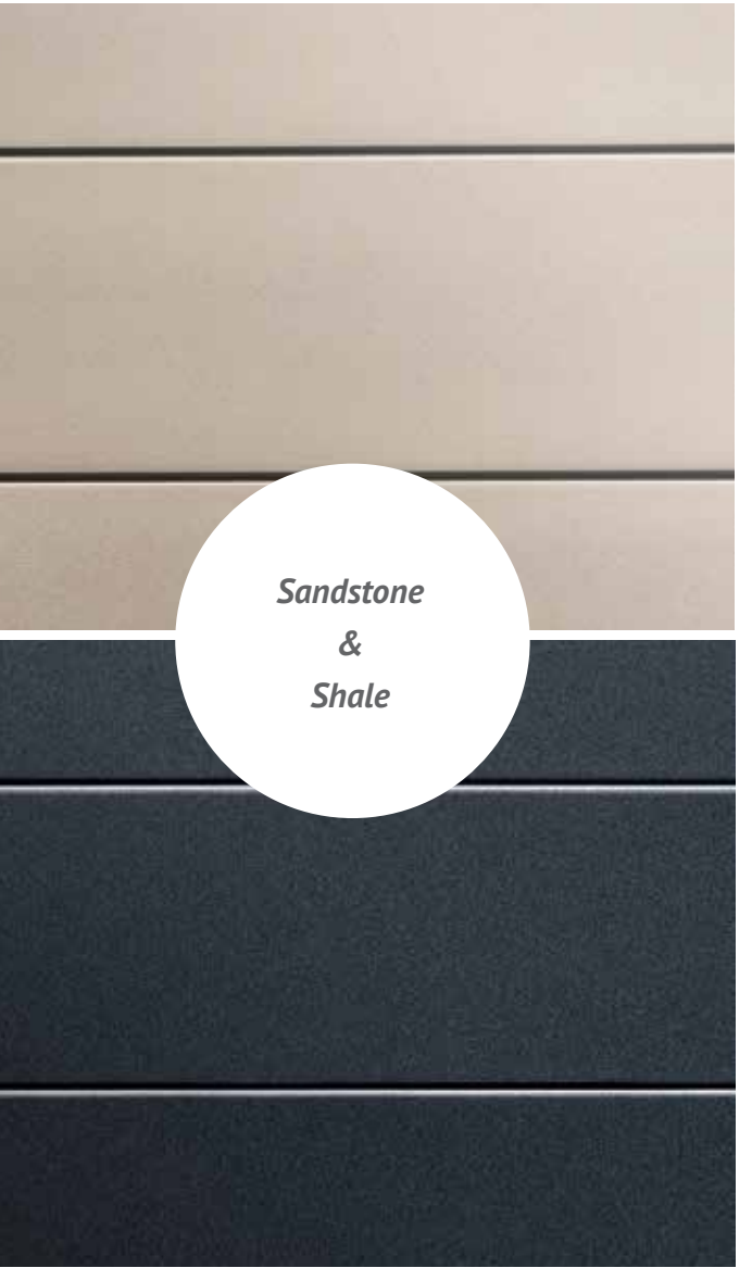
Sandstone & Shale

Bronze & Brushed Nickel A metallic sheen in the Brushed Nickel comes to life when sunlight reflects on its textured finish. A satin finish on the Bronze siding creates an exciting backyard focal point.