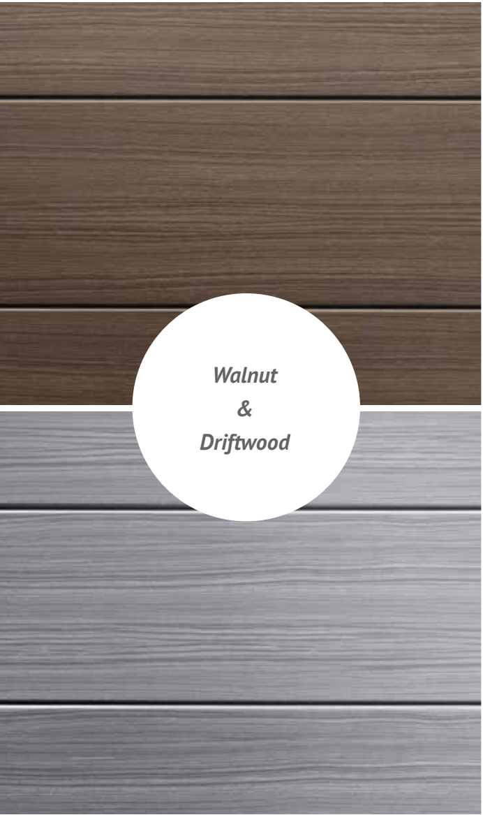
Walnut & Driftwood

Walnut & Driftwood With their subtle grain pattern and natural color tones, these two wood-pattern options complement a wide range of home and patio styles.