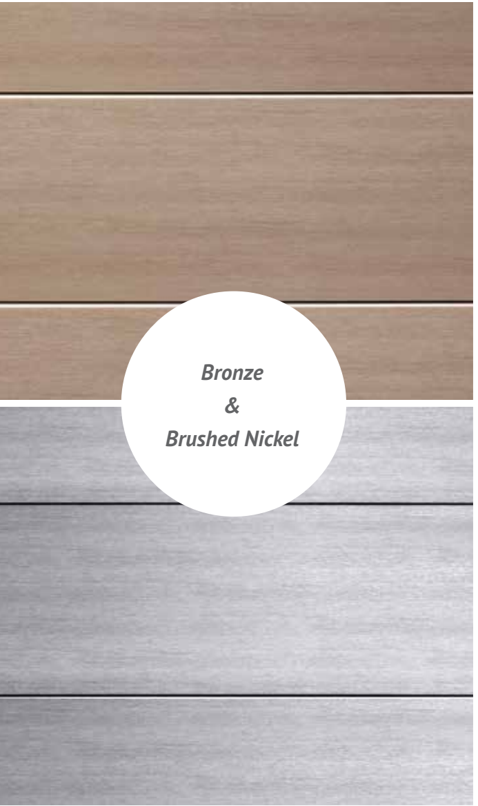
Bronze & Brushed Nickel

Walnut & Driftwood With their subtle grain pattern and natural color tones, these two wood-pattern options complement a wide range of home and patio styles.