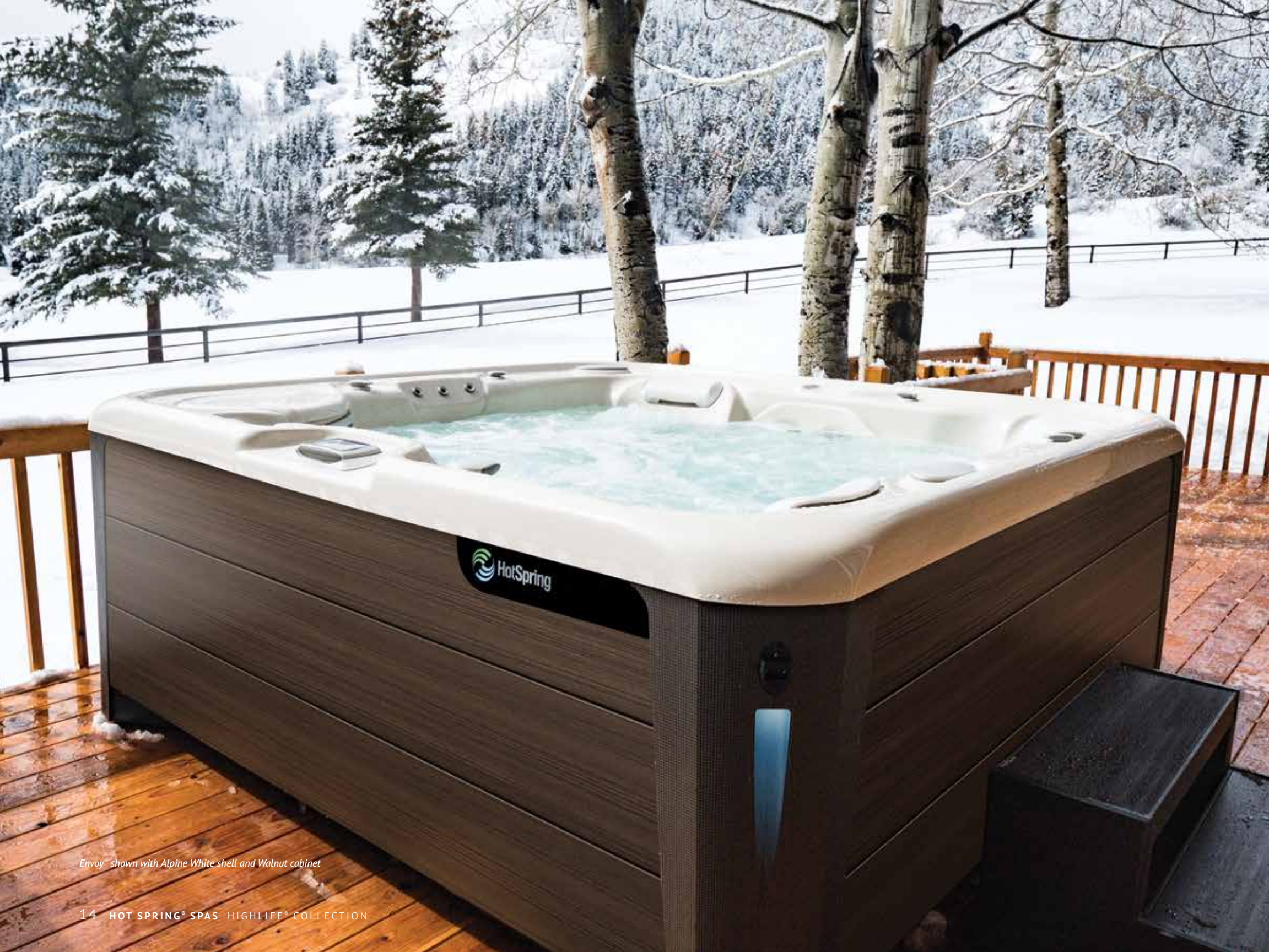
Envoy® shown with Alpine White shell and Walnut cabinet